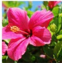
The Hibiscus Flower